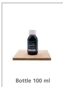
Bottle 100 ml